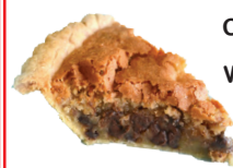
Chocolate Chip Walnut Pie